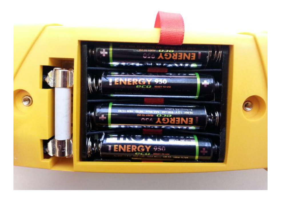
Fig. 4.1 Correct batteries / accumulators polarity and the fuse location

Batteries/accumulators are inserted into the device by unscrewing two screws and removing the batteries / fuse compartment cover, see Fig. 2.2. Then remove old batteries/accumulators and insert new ones. Observe correct polarity: