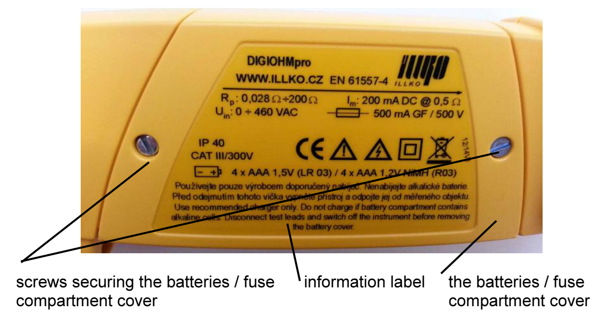
Fig. 2.2. Detail of bottom side