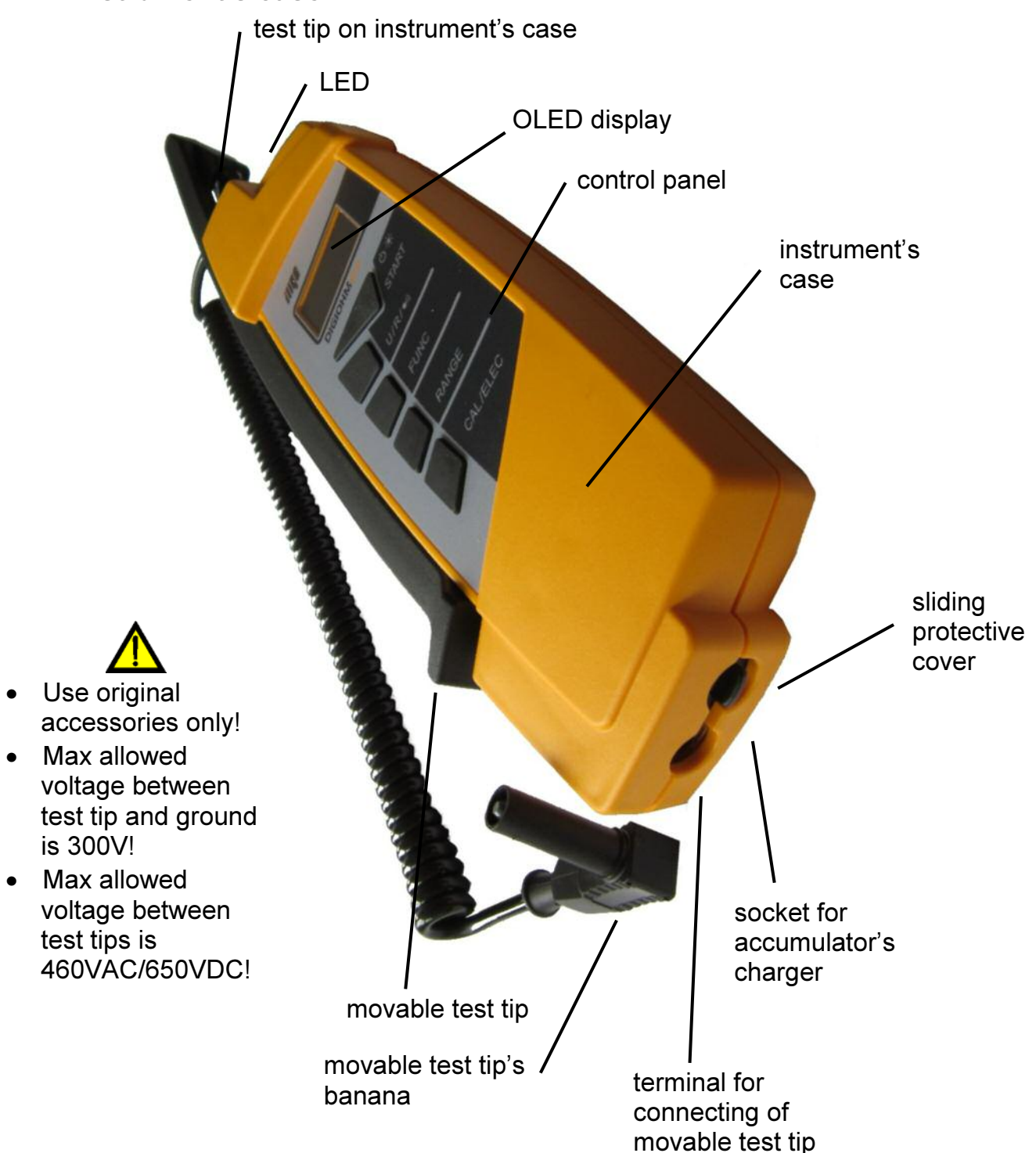
Fig. 2.1. Top side

When not in use, the instrument's body and the movable test tip can slide one into another in such a way that they form a compact unit, while the sharp end of the measuring tips are safely hidden. Against accidental ejection are both parts secured by non-contact magnetic latch.